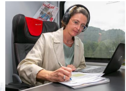
Meine klimafreundliche Dienstreise