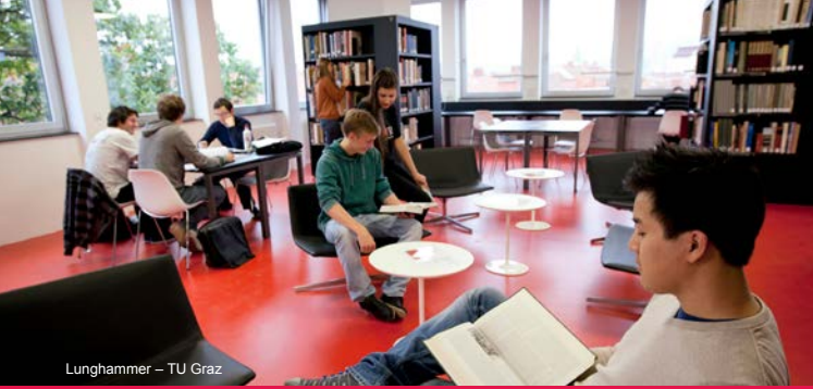
Lunghammer – TU Graz