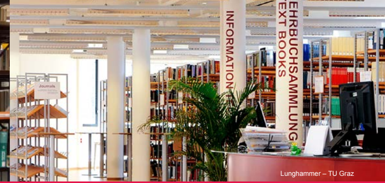
Lunghammer – TU Graz