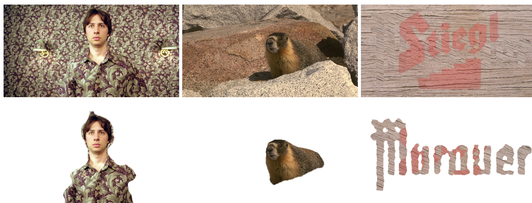
Figure 4. Interactive segmentation results using on-line random forests and a Total Variation based segmentation algorithm.

sults in fact are identical to the off-line model and are thus skipped here. For further details about the approach we refer the reader to [20].