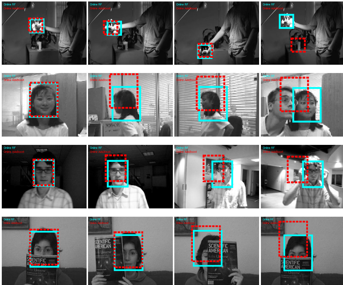
Figure 3. Comparison of ORFs and OAB on four public sequences.