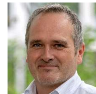
Head of the Institute