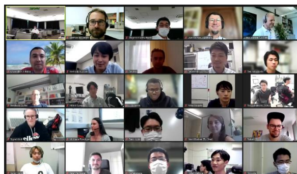
Fig. 3: Online group photo of participants of the International Summer School on PEFCs.

Students were able to present and discuss their own research work online in a poster session. A total of 25