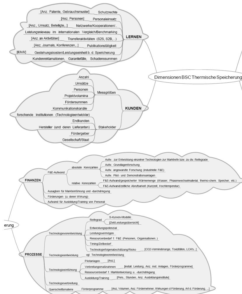
Fig. 2: Examples of indicators for the balanced scorecard “heat storage”

To use the Balanced Scorecard method for the development of a research-oriented masterplan we adapted the common tool to our specific situation. At the beginning we decided to use the four original perspectives as described above thereby restricting the idea to develop new or other perspectives, either substitutionally or additionally. We found out that even if new perspectives may have fitted better to our intention to find a methodology for controlling the development and diffusion of a masterplan we decided to use the original ones as they are well known and adjustable to our needs.